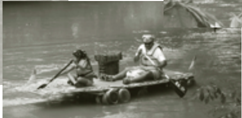
USS Support Our Troops