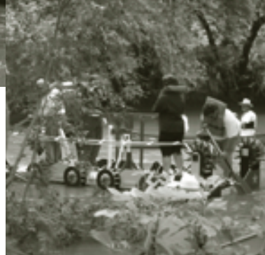
The Hole in the Wall Gang