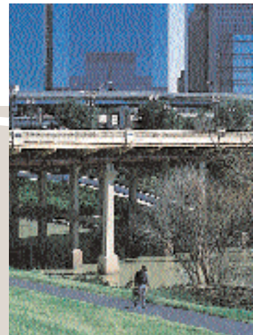
B Urban Green Parkspace