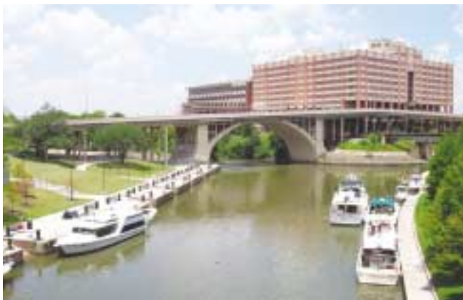
⑤ Historic Allen's Landing has been reborn as a City landmark.

With the removal of the adjacent Elysian Viaduct, Frostown Urban Garden expands James Bute Park into a 12-acre outdoor art environment.