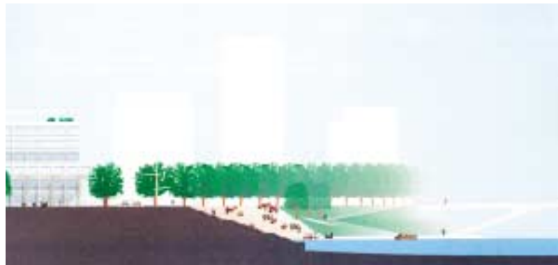
⑧ Section across the widened Bayou near Crawford Street and Frostown Urban Garden shows bank ledges and steps transitioning to the water edge. A new pedestrian bridge at Austin Street increases access to both Bayou banks.