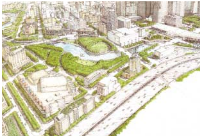
② Festival Place, a mixed-use performing arts redevelopment program, is planned for the current Post Office site.

Framing Downtown as its backdrop, a live-oak shaded amphitheater on the Bayou's north bank will provide a new outdoor venue for the Theater District and reinforce Sesquicentennial Park. A new mixed-use cultural and performance center will be constructed on the existing Post Office site. Expanding the Theater District across