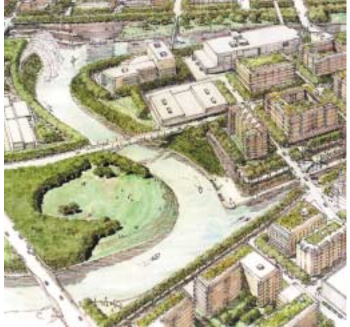
⑪ Commemorating historic Frostown, the Frostown Urban Garden will offer a site for permanent and rotating works of environmental art.