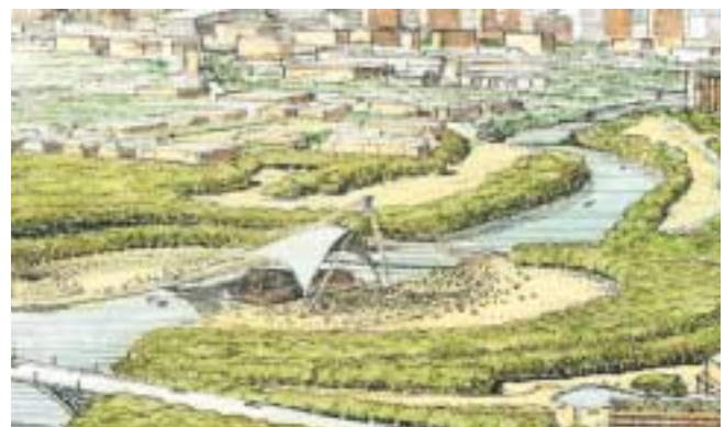
③ Symphony Island

Programmed for large audiences on grassy amphitheater-type seating, this proposed open-air facility promises a sylvan setting for outdoor performances and events during Houston's temperate winters.