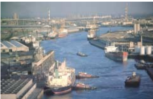
Houston's Ship Channel is the anchor for East End industry.