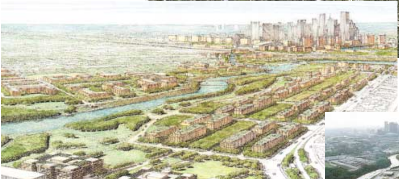
① Richardson Place serves as a Bayou gateway for Fifth Ward residents.