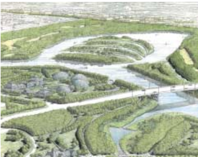
④ Turkey Bend Ecology Park