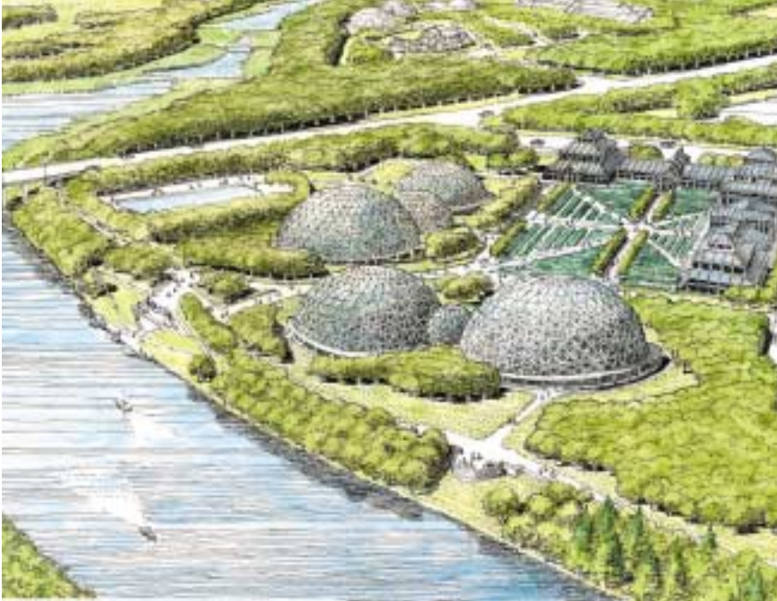
⑤ North Side Sewage Treatment Facility redevelopment