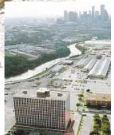
Existing Halliburton site