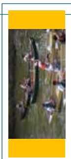
BUFFALO BAYOU REGATTA + BAYOU SPRINTS

BUFFALO BAYOU PARTNERSHIP 1113 VINE STREET, SUITE 200 HOUSTON, TEXAS 77002