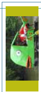
ANYTHING THAT FLOATS PARADE