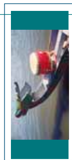
HOUSTON DRAGON BOAT FESTIVAL

At this year's Buffalo Bayou Beckons events, be the first Regatta racer to cross the finish line at Allen's Landing and you'll take home a performance-grade laminate paddle signed by some of Houston's biggest personalities.